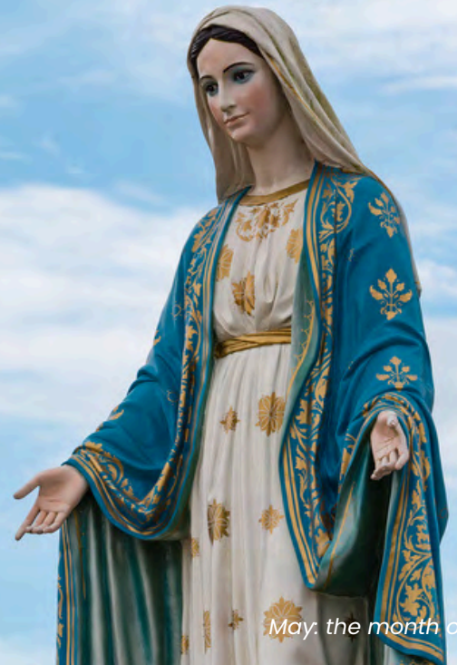
May: the month of Mary