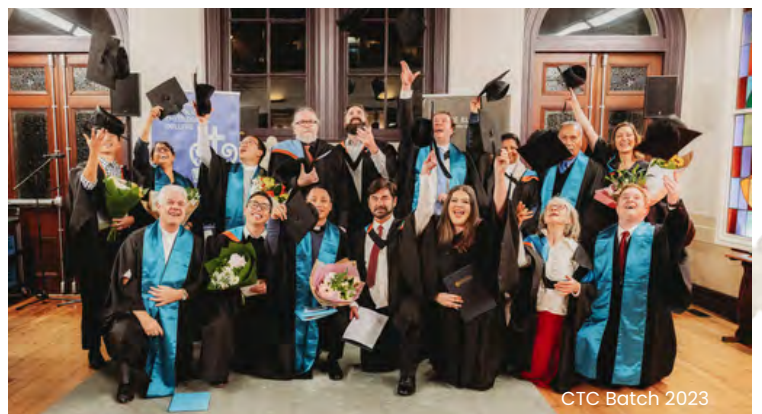
CTC Batch 2023

This month, 20 students will graduate and receive their respective academic degrees on the 24th of May. This will mark the culmination of their years of hard but joyful academic journey with CTC. It also marks the commencement of their renewed pastoral ministry, but this time fortified with additional theological knowledge.