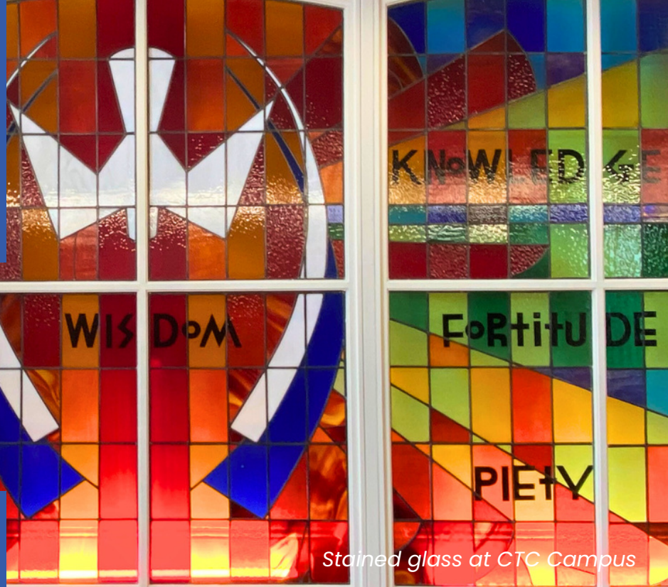
Stained glass at CTC Campus