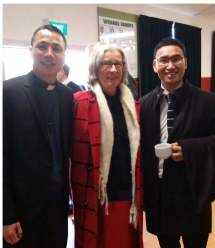
A joyous occasion indeed!