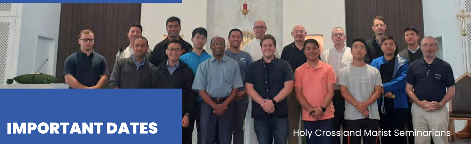
Holy Cross and Marist Seminarians