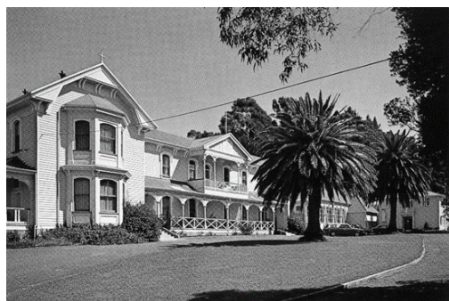
Mount St Mary's College Greenmeadows

The result is Good Shepherd College, a theological college where both seminarians and lay people study theology.