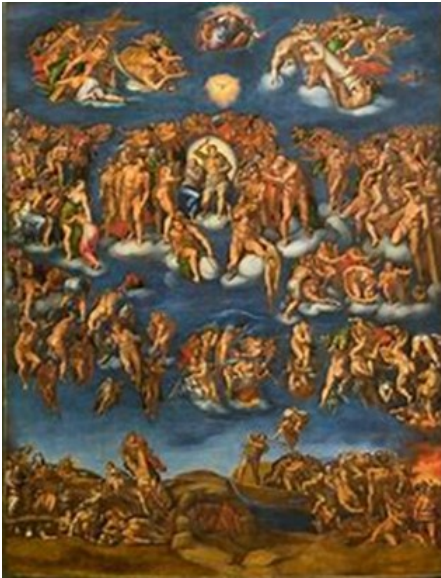
The Last Judgment